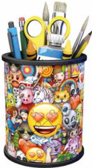
Pencil Cup Emoji No. 11 217 3