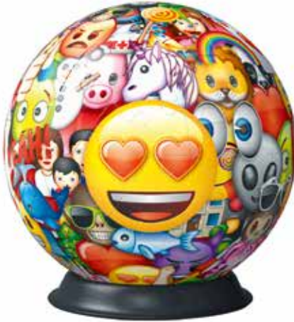
Puzzle-Ball Emoji No. 12 198 4